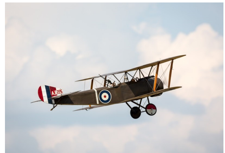
Welcome to the FAI F4C/H World