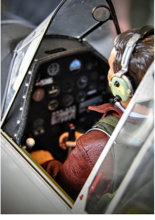
Championship in Meiringen!